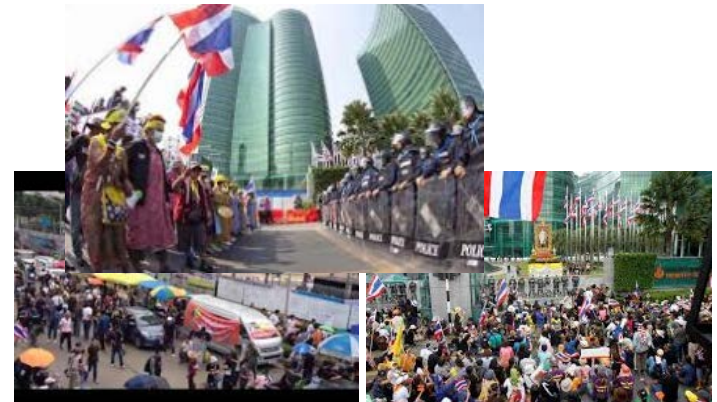
Office blockade 2014