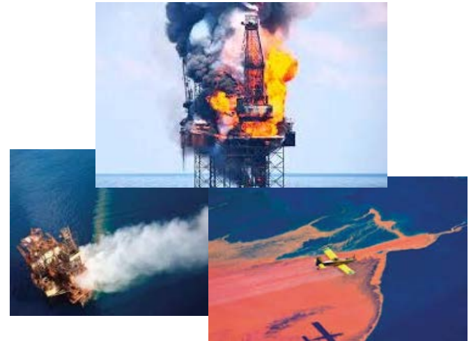
Montara incident in 2009