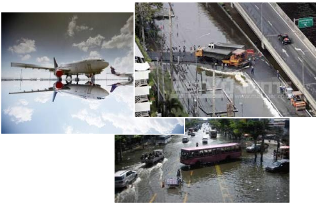
Major Flood 2011