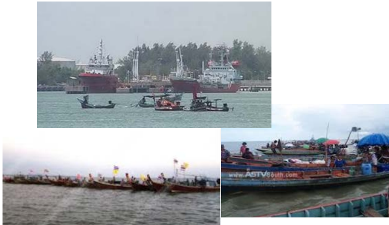
Songkhla Channel blockade 2008