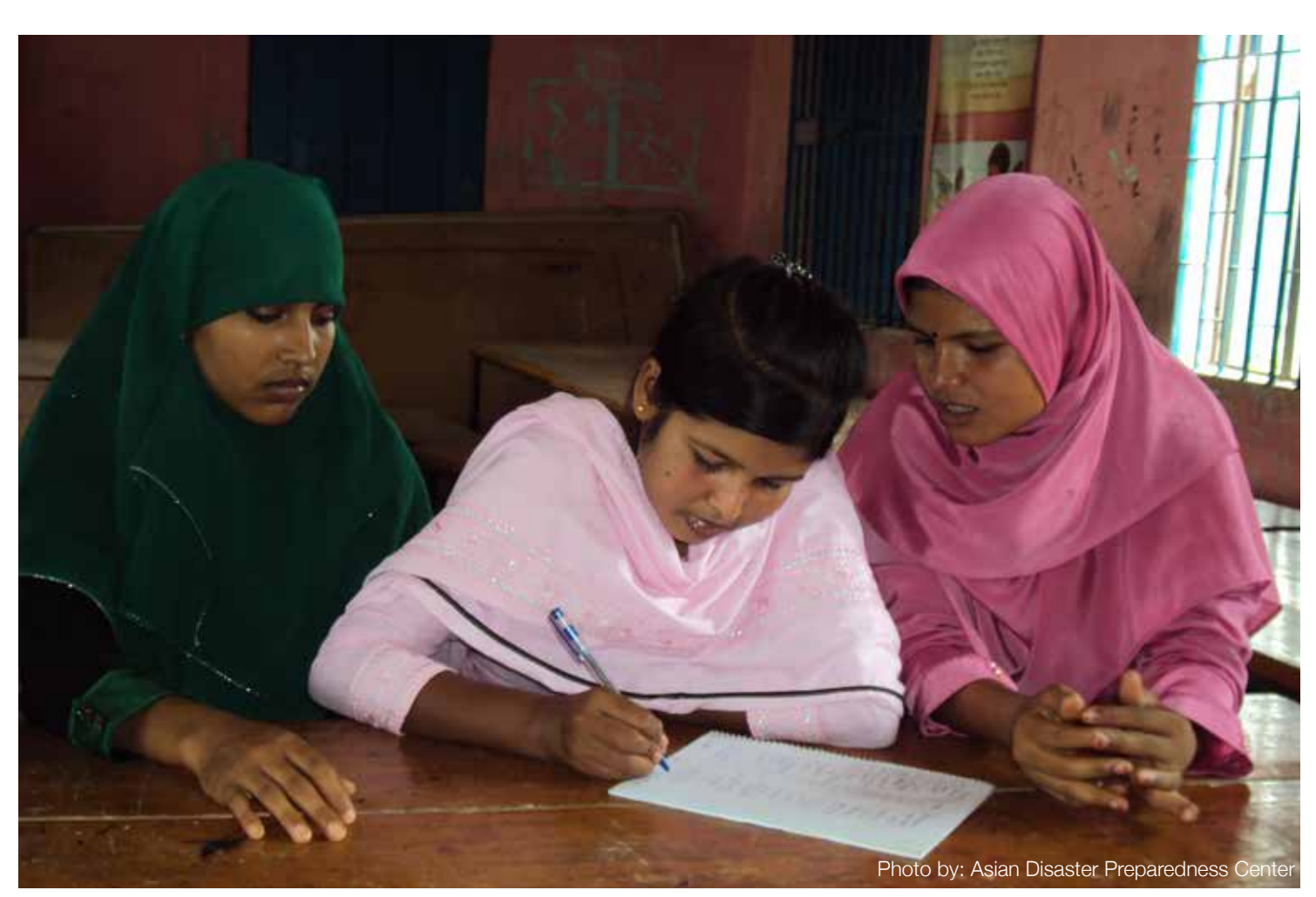
Young women from Sirajganj join monthly meetings on emergency preparedness..

As Jubida recommended, "the CADRE course could [in the future] address these issues. In the course, we're all equal participants, so it's a good opportunity to learn how to overcome these challenges."