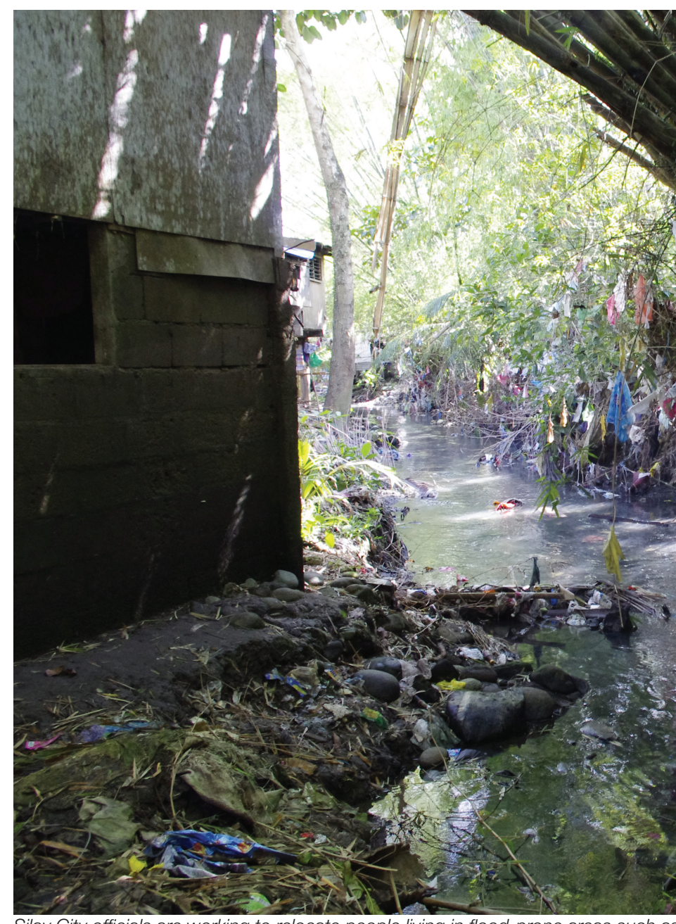
Silay City officials are working to relocate people living in flood-prone areas such as

Mr. Biacon's family remembers the latest flood clearly; it took place just one week before our interview. Mr. Biacon stayed overnight at the Silay City rescue group's office and the other family members were taken to the civic center for shelter during the flood.