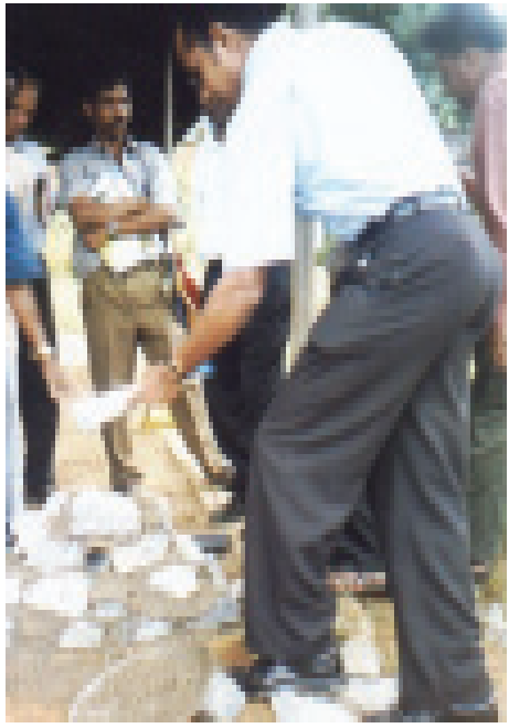
The skills training workshop gives practical demonstrations to craftsmen

Course module developed by CHPB. Resource persons from CHPB, NBRO, ITDG, Meteorological Department, and the private sector.