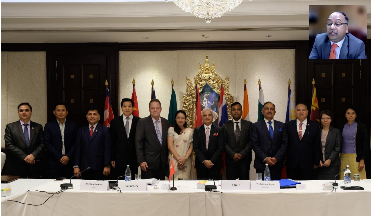
BOT members and representatives