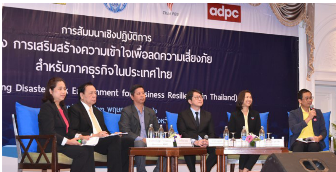
Dr. Bhichit Rattakul, Special Advisor, ADPC, participated in a panel discussion on the role of businesses in reducing disaster risk in Thailand

The seminar orientated participants on using a Quick Risk Estimation (QRE) tool that was developed by the United Nations Office for Disaster Risk Reduction (UNDRR) to identify and understand current as well as future risks that human and physical assets face. The tool contains hazard indicators that are aligned with the 10 Essentials for Making Cities Resilient Scorecard in the context of the Sendai Framework for Disaster Risk Reduction 2015 – 2030 (SFDRR) and the Sustainable Development Goals (SDGs).