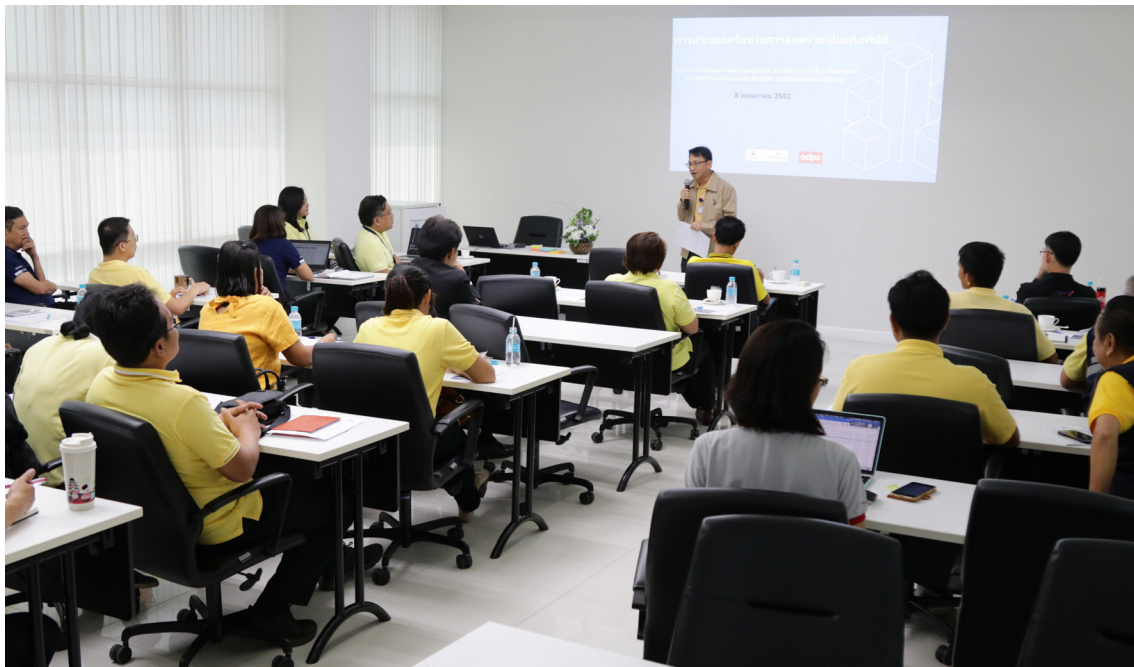
Stakeholder meeting with local authorities, government and technical agencies

The project was implemented in industrial areas of Ayutthaya and Bangpoo (Samut Prakan), which have been inundated by flooding in recent years, and aimed to enhance the flooding preparedness of communities through improved business continuity management (BCM) and community engagement.