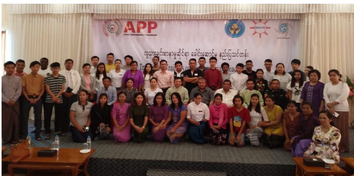
Opening ceremony for sub-national level training on BCM at Pyay District

Therefore, he was able to deliver a basic orientation on BCM to the senior members of the three companies. Therefore, the BCM training sparked his interest to be a facilitator to assist other companies to develop their BCP whilst exploring his options to become a licensed trainer for Business Continuity Management in Myanmar having recognized a gap in the market in Myanmar for such services.