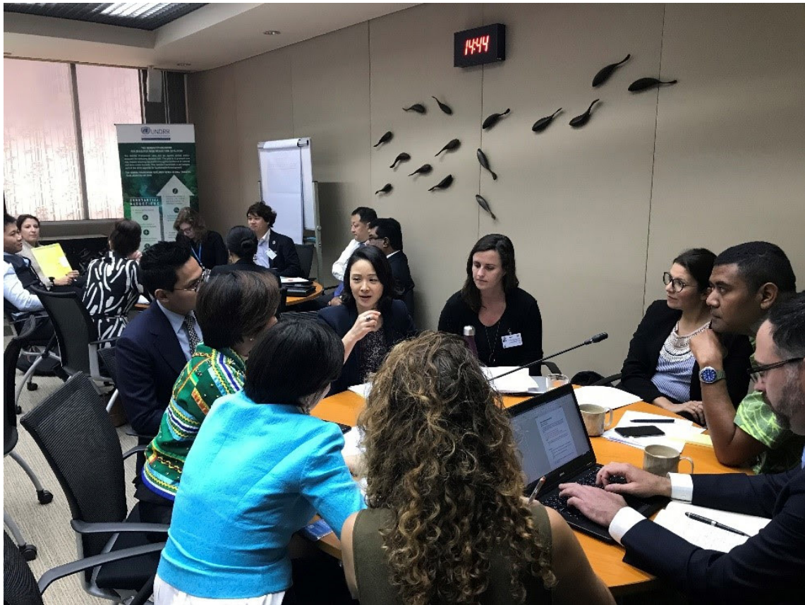
Breakout group discussions at the consultative workshop