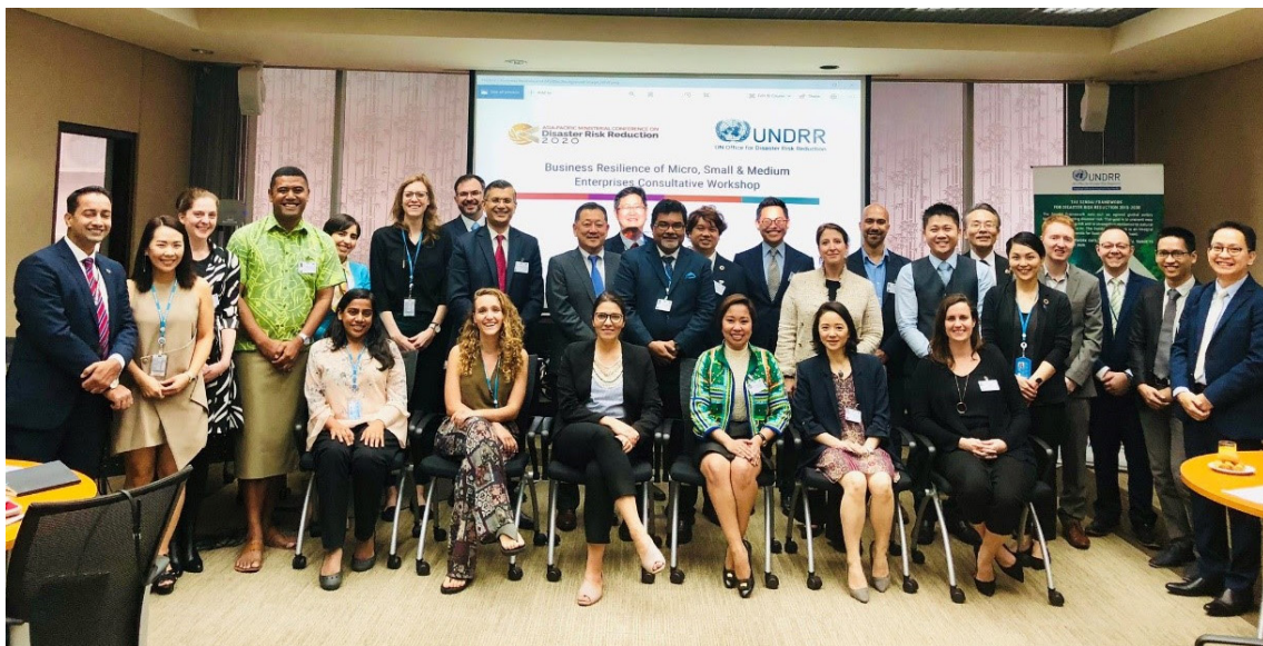
Workshop participants gathered for a group photo

ADPC participated in a consultative workshop organized by the United Nations Office for Disaster Risk Reduction (UNDRR) Regional Office for Asia and the Pacific in Bangkok on 11 th December 2019. Recognizing the critical need to enhance business resilience to reduce economic losses and strengthen overall resilience of the national economies, the consultation focused on the resilience building needs of business enterprises, in particular Micro, Small and Medium Enterprises (MSMEs).