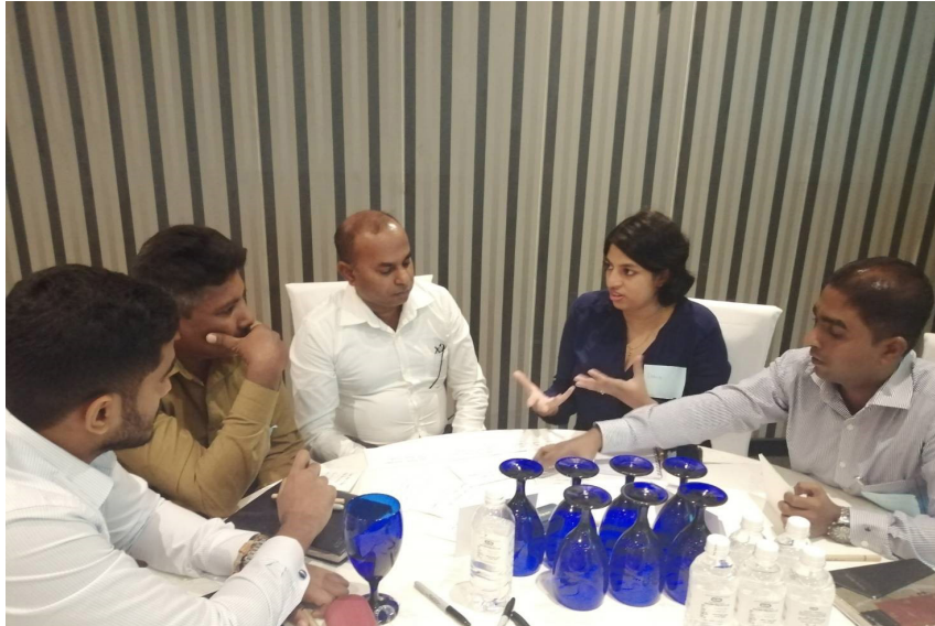
Interactive discussions during the Co-creation workshop

Subsequently, a Co-creation Workshop was organized on 2 nd October 2019 attended by selected SMEs and key support agencies from the public and private sectors to brainstorm and discuss what kinds of solutions the project can offer to assist SMEs in adapting and reducing recurrent losses from climate related events and how the project can support the commercialization of the product in Sri Lanka. Led by the project partner, Copenhagen Institute of Interaction Design (CIID), the workshop helped in prioritizing key needs for the SME climate resilience product and to capture relevant ideas, concerns, and questions from concerned stakeholders towards its design.