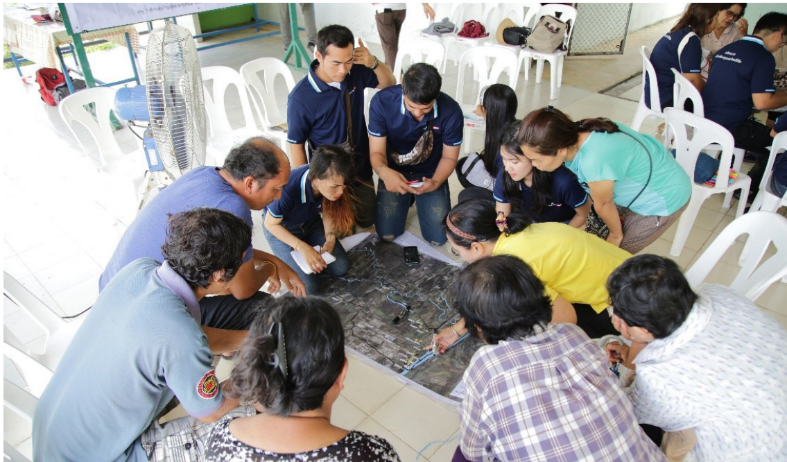
Marigot Thailand volunteers facilitated the community based disaster risk management activities

This initiative was part of Swarovski's "Positive Production Program" for its owned production plants with the aim to work towards sustainability excellence in its manufacturing and production locations by 2020.