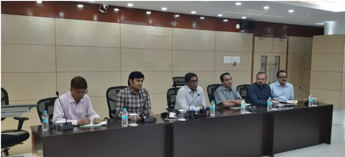
The Principal Secretary and Additional Secretary, Disaster Management Department of Government of Bihar and Managing Directors addressed the PSUs

The training workshop was attended by 30 participants from PSUs of various departments of the Government of Bihar including Energy, Roads, Bridges, Food and Consumer Protection, Education, Health, Transport. In completing the modules and facilitated sessions, the participants were able to formulate the basis of a Business Continuity Plan (BCP) for their respective PSUs. In the final session of the workshop the participants were asked to consider the action plan for preparing their BCP and next steps for when they return to their PSUs.