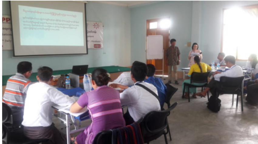
Sessions of the BCM training delivered by the iPrepare Business unit

A national level training of trainers (ToT) workshop on Business Continuity Management (BCM) was conducted at Disaster Management Training Center (DMTC) in Hinthada Myanmar as part of MPP activities from 22 nd – 27 th July 2019. 24 Participants from government departments, civil society organizations and private sector attended the training. The aim of the training was to raise awareness and understanding of the concept of BCM including how the BCM can be an effective tool for Business Resilience as well as to build knowledge on key steps for implementing BCM to create a pool of qualified trainers to roll out BCM training at the local level in Myanmar.