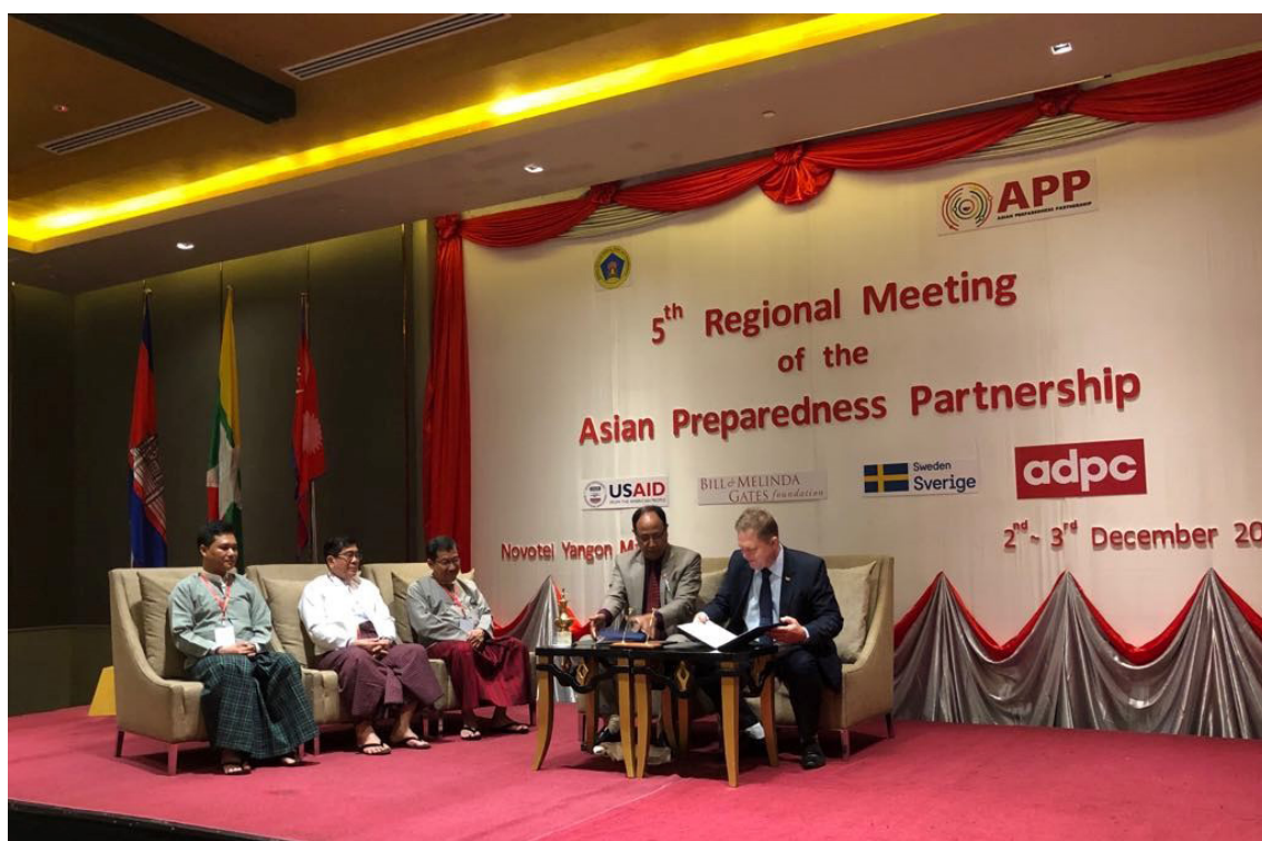
Mol signing ceremony between FNCCI and ADPC