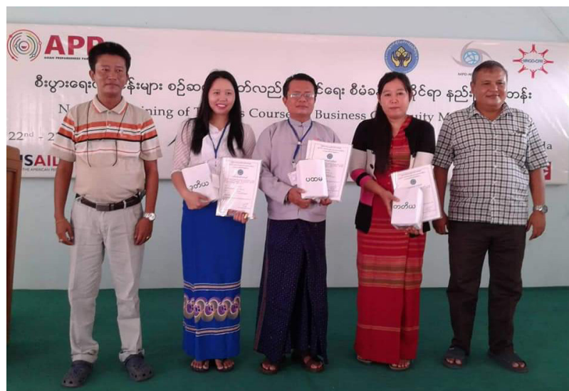
Training participants receive certificates recognizing their successful completion of the course

The training provided an opportunity for the participants to learn practical knowledge and tools in implementing BCM, which can be applied not only by businesses, but also any type of organizations to continue their operation at the time of a disaster.