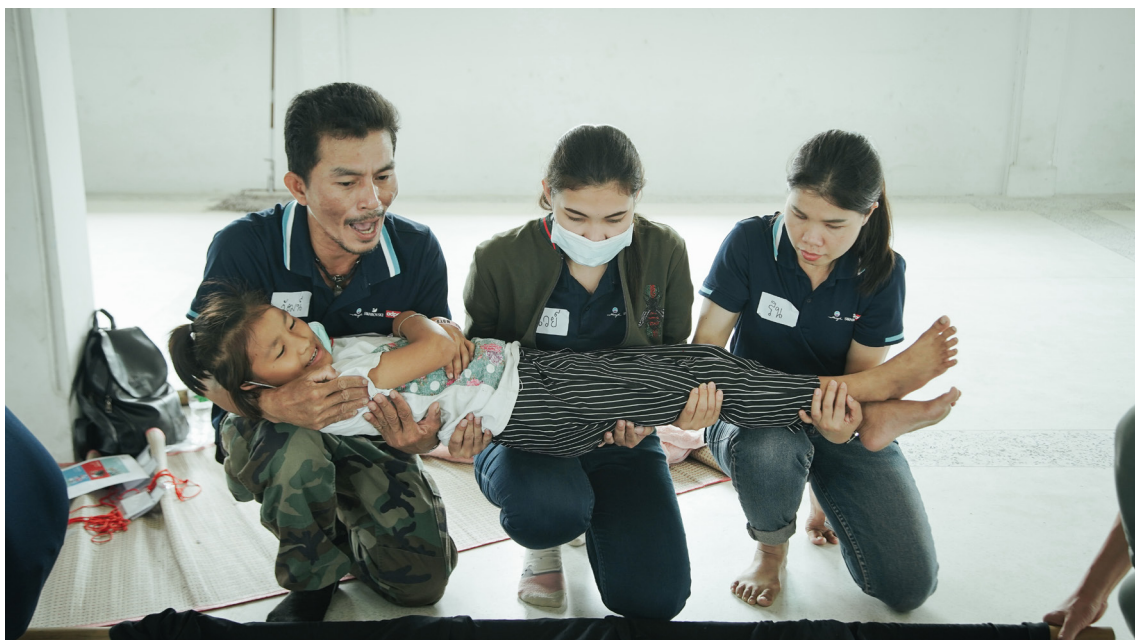
Awareness raising activities for youth carried out by Marigot Thailand volunteers

In particular, the collaboration with ADPC sits under Stream 3 of the Program through which Swarovski aims to positively impact its employees, their communities and contribute to achieving the UN Sustainable Development Goals by addressing business relevant sustainability issues such as equality, wellbeing and environmental challenges.