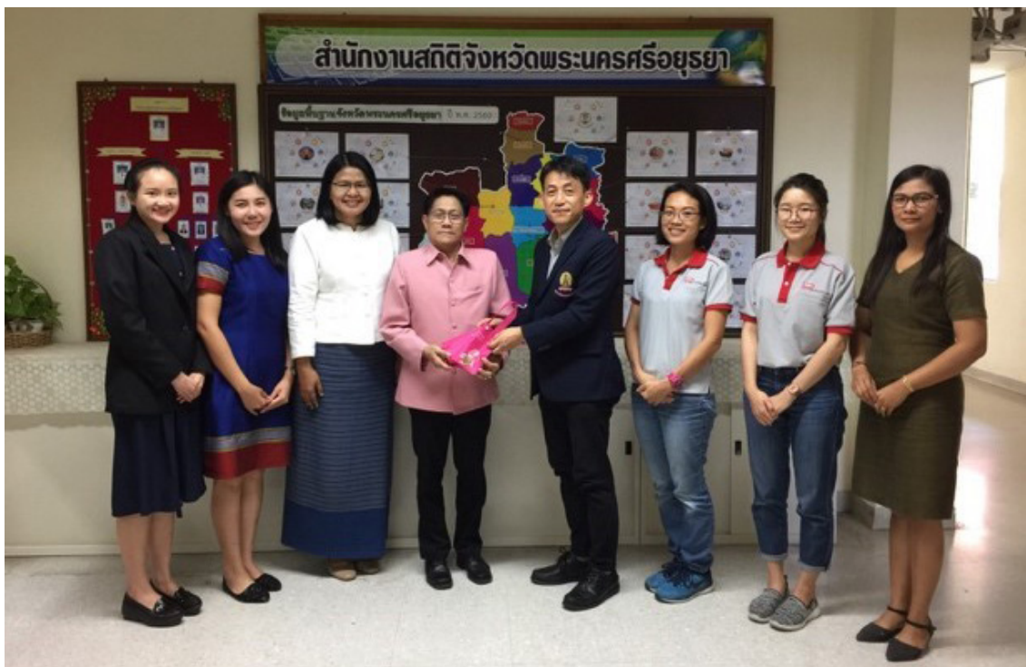
ADPC and SATREPS project team meeting at National Statistics Office, Ayutthaya City Hall

SATREPS is a Japanese government program that promotes international joint research implemented by a consortium including: The Japan International Cooperation Agency (JICA) provides development assistance (ODA), Japan Science and Technology Agency (JST) and research institutes and government agencies in Thailand and Japan.