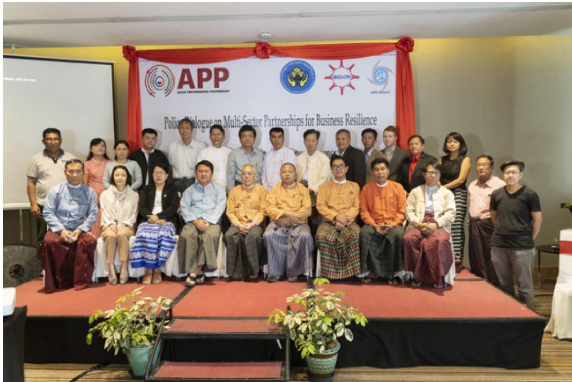
Participants of the dialogue gathered for a group photo

The first part of the dialogue focused on the theme of Business Resilience, specifically the engagement and building capacity of the private sector, particularly SMEs to withstand disruption from disaster events which requires support and inputs from not only businesses themselves, but also relevant government agencies and other business support actors.