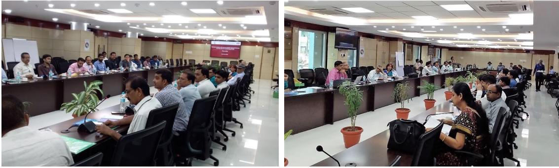
Participants from the PSUs were guided through the BCM methodology during the interactive sessions

The training workshop was attended by 30 participants from PSUs of various departments of the Government of Bihar including Energy, Roads, Bridges, Food and Consumer Protection, Education, Health, Transport. In completing the modules and facilitated sessions, the participants were able to formulate the basis of a Business Continuity Plan (BCP) for their respective PSUs. In the final session of the workshop the participants were asked to consider the action plan for preparing their BCP and next steps for when they return to their PSUs.