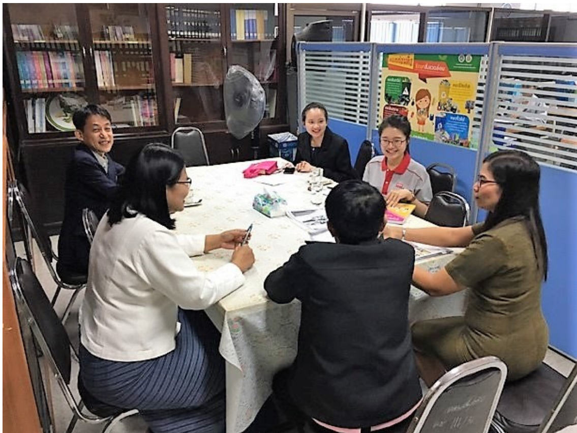
ADPC and SATREPS project team meeting at National Statistics Office, Ayutthaya City Hall

From September 2019, ADPC also commenced a further assignment to collect statistical data concerning social, economic and demographic statistics, damage data from the 2011 flood from the Ayutthaya Province, conducted structured interviews with Tambol (sub-district) leaders in the vicinity of Rojana Industrial Park and carried out focus group interviews with community leaders to explore their disaster preparedness status and capacities as well as their experiences during the flood in 2011. This has contributed to the deeper analysis of communities regarding disasters, including development of a more detailed social vulnerability index for the surrounding communities in the Industrial Park.