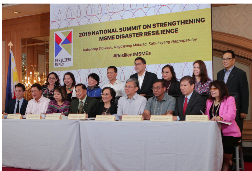
Representatives from key agencies of the MSME Resilience Core Group (RCG)

The 2019 National Summit on Strengthening MSME Disaster Resilience took place in Metro Manila, Philippines on 18 th July 2019. The summit reaffirmed public-private partnership modality for the project on Strengthening MSME Disaster Resilience in the Philippines. Among the signatories were OCD and PDRF of PHILPREP, together with ADPC.