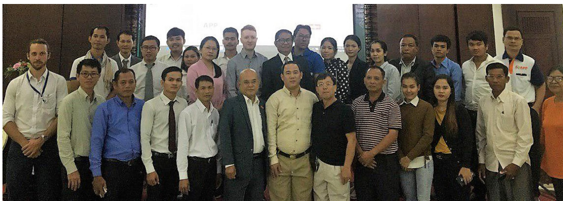
Forum participants gathered for a group photo

Presenting the findings to the 30 participants, the majority of whom were SME owners themselves, helped clarify about the key issues facing business owners in the country in view of disaster resilience including awareness, existing mitigation measures and previous experience of disaster events.