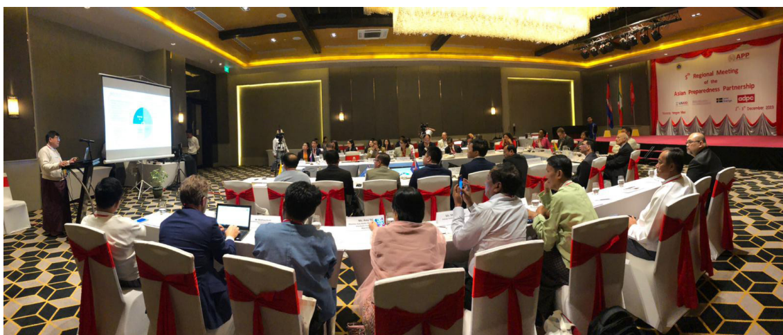
Proceedings of the 5 th Regional Meeting of the APP

As part of the overall APP program, the 5 th Regional Meeting of the Asian Preparedness Partnership (APP) was conducted from 2 nd to 3 rd December 2019 in Yangon, Myanmar. A total of 60 participants joined the meeting, including APP Regional Steering Committee members from Governments, Local Humanitarian Networks and the Private Sector from six APP countries. BMGF and observers from other international and UN organizations and development partners, notably USAID/OFDA also joined the meeting.