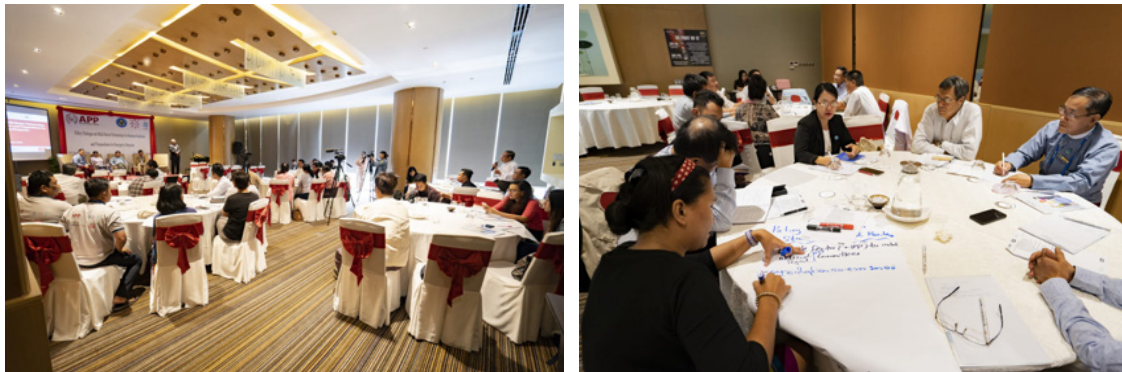
Participants brainstormed about potential policy interventions

The first part of the dialogue focused on the theme of Business Resilience, specifically the engagement and building capacity of the private sector, particularly SMEs to withstand disruption from disaster events which requires support and inputs from not only businesses themselves, but also relevant government agencies and other business support actors.