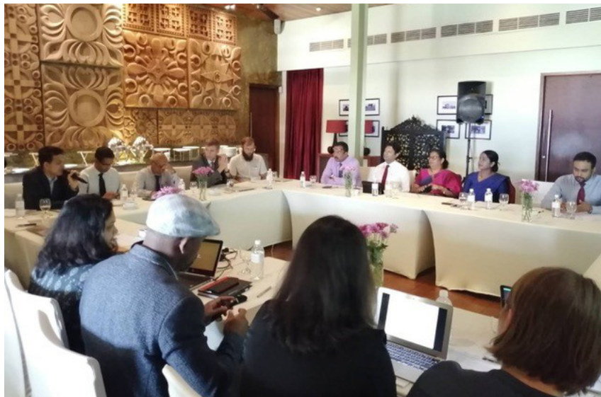
Proceedings of the Project Reference Group meeting

Subsequently, a Co-creation Workshop was organized on 2 nd October 2019 attended by selected SMEs and key support agencies from the public and private sectors to brainstorm and discuss what kinds of solutions the project can offer to assist SMEs in adapting and reducing recurrent losses from climate related events and how the project can support the commercialization of the product in Sri Lanka. Led by the project partner, Copenhagen Institute of Interaction Design (CIID), the workshop helped in prioritizing key needs for the SME climate resilience product and to capture relevant ideas, concerns, and questions from concerned stakeholders towards its design.