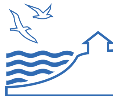
Bangpoo, Samut Prakan