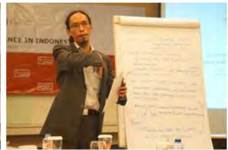
Participants worked in groups according to Roadmap key themes before feeding back to the rest of the forum