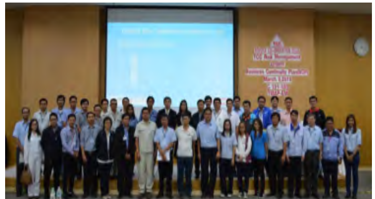
iPrepare Business staff with the workshop participants at Toyota Motor Asia Pacific Engineering & Manufacturing

On 9 March 2016, iPrepare Business in collaboration with Toyota Co-operation club organized a workshop on Business Continuity Management at Toyota Motor Asia Pacific Engineering & Manufacturing, Bang Bor. One hundred and forty-nine people, who were from Toyota's main suppliers, attended the workshop. The workshop was held to raise awareness of impacts caused by business disruption, as well as, importance of planning for business.