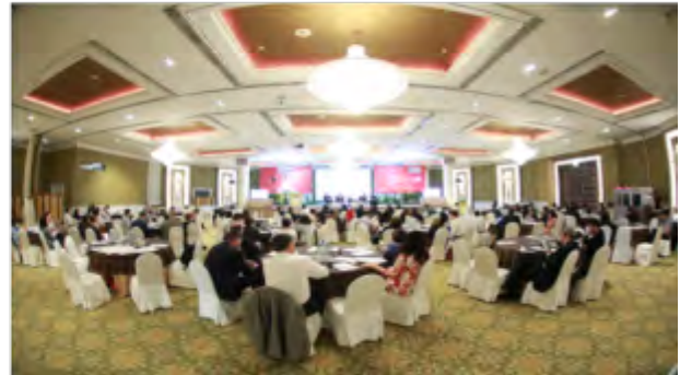
Group Photos and forum atmosphere