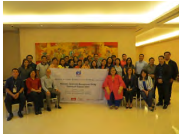
Presentation, group work, discussion and group photo as part of the BCM Training workshop in Manila