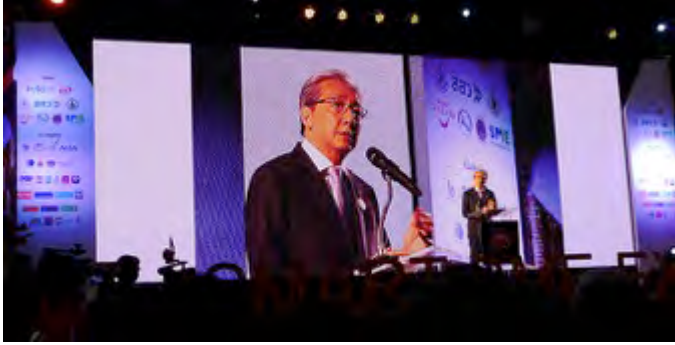
Dr. Somkid Jatusripitak, Deputy Prime Minister of Thailand, speaking during the ceremony