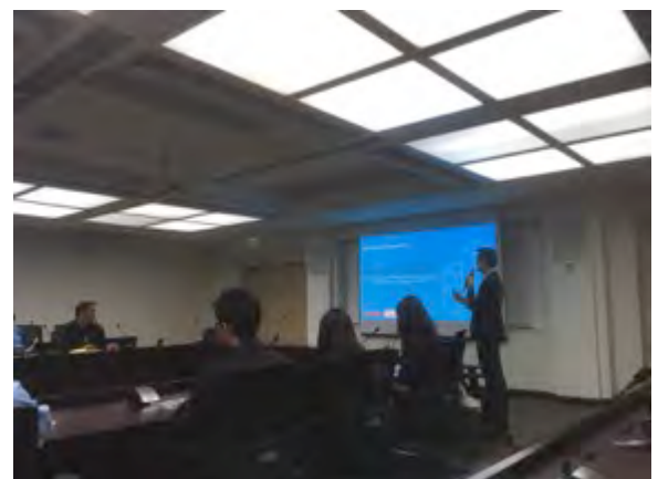
MoU signing and program orientation