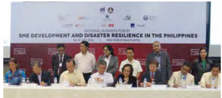
MoU signing at the Philippines forum

assessment and contingency planning; engaging key stakeholders in the fields of micro small and medium-sized enterprises (MSME) development and disaster risk reduction and management (DRRM)/ climate change adaptation (CCA) in order to help promote the adoption of BCM and promoting the implementation of the SFDRR (2015-2030) through the DTI and OCD/NDRMMC.