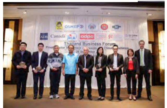
Participating SMEs receiving the Disaster Resilient SME Champion Trophies