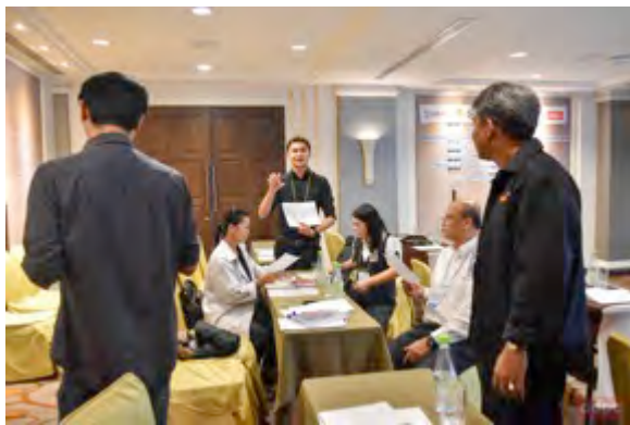
Group photo and workshop atmospheres