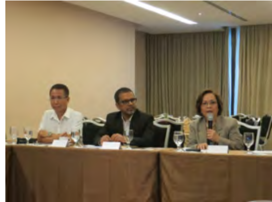
Facilitators and participants engage in the consultative meeting hosted in Makati City, Manila

To share with stakeholders the results of the SME resilience survey and the enabling environment policy review, the DTI-BSMED and the iPrepare Business facility organized a consultative meeting at the City Garden Grand Hotel in Makati City on 19 February 2016.