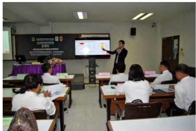
iPrepare Business participating DPM Academy training and providing BCM orientation