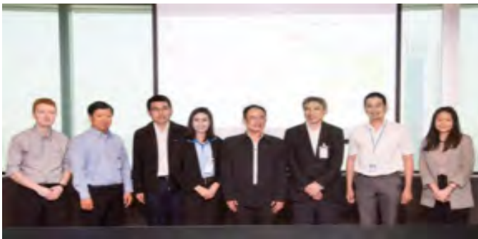
Group photo of PTTEP BCM officials, members of Toyota Co-operation Club and iPrepare Business team at PTTEP HQs

The iPrepare Business facility was invited by Toyota Co-operation Club (TCC) to visit PTT Exploration and Production (PTTEP) on 17 February 2016. The purpose of the visit was to observe BCM activities and practices at PTTEP. The development of the BCM approach at PTTEP has actively been employed since 2012, and selected divisions of the company have achieved ISO 22301 BCM Systems certification in 2015. The ISO certification process and PTTEP certifying activities were shown to be valuable example of a good practice of a private enterprise establishing and developing their