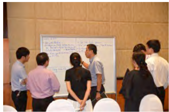
Atmosphere of the forum