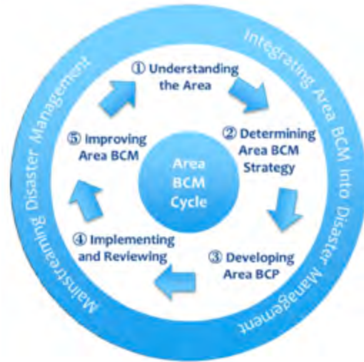
Area BCM Cycle

Following the kick-off meeting and the 1 st workshop, the iPrepare Business facility had several meetings with NESDB officials and