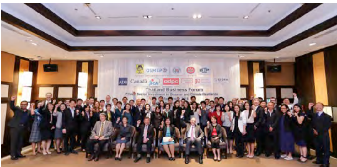
Participants cheer during a group photo at the Thailand Business Forum