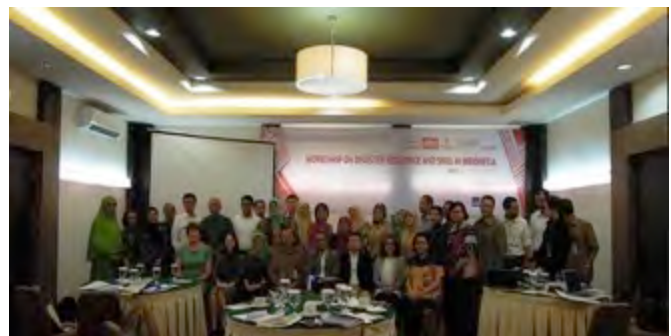
Group Photo of the participants from MoCSMEs and various sectors in Indonesia

Through bringing actors from different sectors to discuss disasters and SMEs the workshop was able to raise the awareness of participants, the majority of whom are from SME promotion/development sectors, on the importance of embedding disaster resilience into SME development programs.