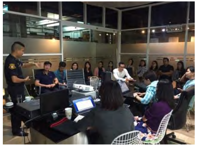
Top left: Workshop 2 on BIA and Basic Risk Assessment at Transtron (Thailand) Co., Ltd., Top right: Workshop 3 on Business Continuity Strategies at Thongsomboon Club, Bottom left & right: Workshop 4 on BCP Review and Exercise at Exercise at Agribusiness Co., Ltd and First Contact Center Co, Ltd.