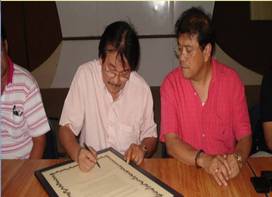
North Luzon Disaster Risk Reduction Network