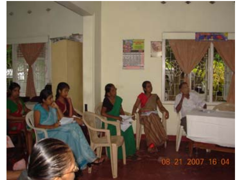
Part of the District Staff