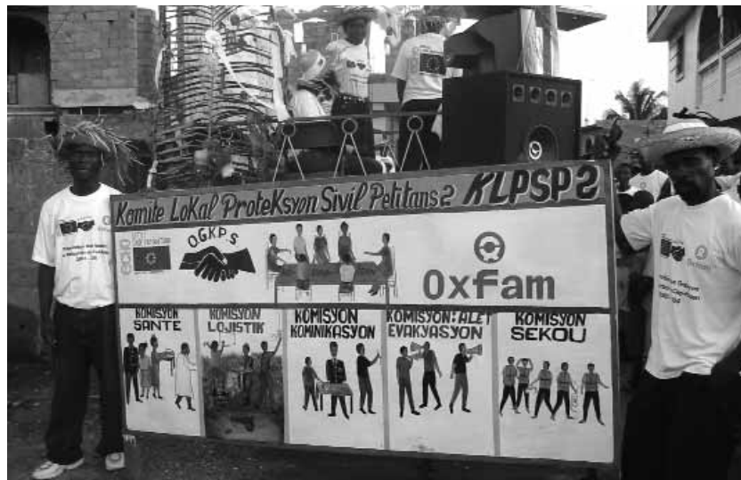
A panel created by the Local Civil Protection Committees in September 2004