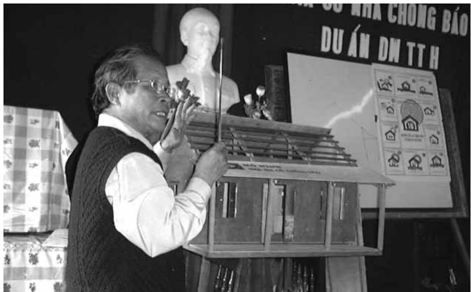
Training builders on key safety points