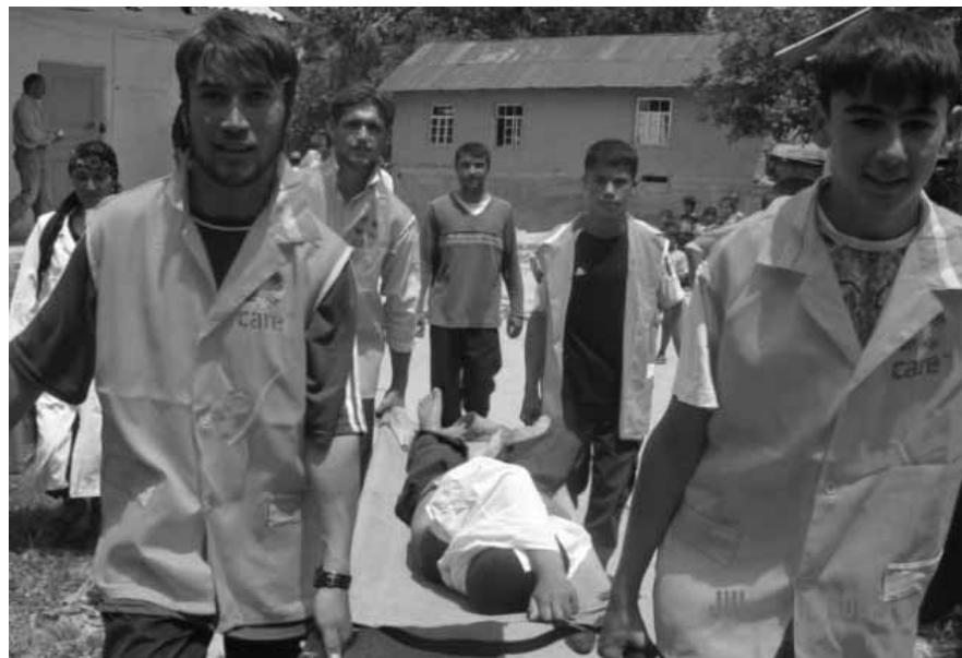
A disaster simulation exercise at the community level

The "Disaster Preparedness Action Plan Tajikistan" Project CARE International