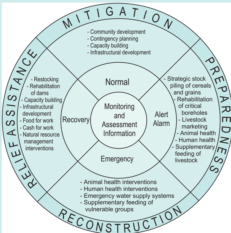
The Drought Cycle