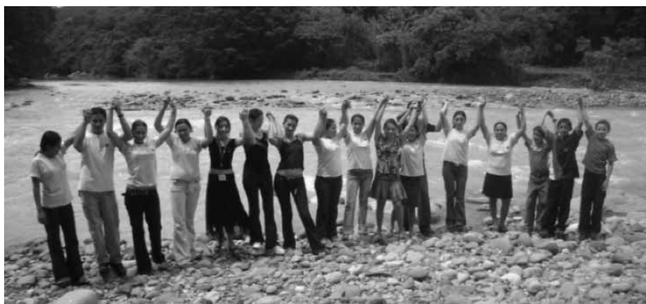
Children participating in Plan International's DRR activities