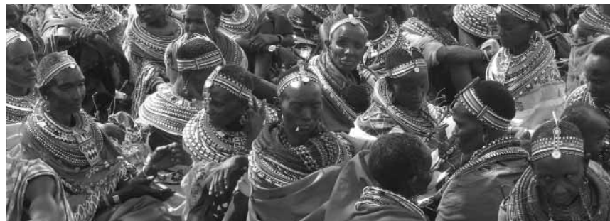
A local community participating in the project

(In partnership with CODES, PISP and CIFA)