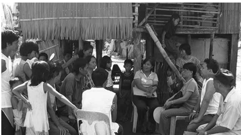
A focus group discussion in Barangay Lasip Chico

Center for Disaster Preparedness (CDP) (In partnership with ADPC)