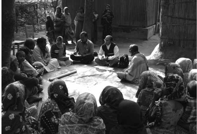
Participatory development of an action plan

The project aims to demonstrate that increasing the resilience of poor communities' livelihoods reduces vulnerability to disaster risk while contributing to poverty reduction. Evidence of the impact of this approach is used to influence local government officials and policy makers to be more responsive to the needs of the poor.