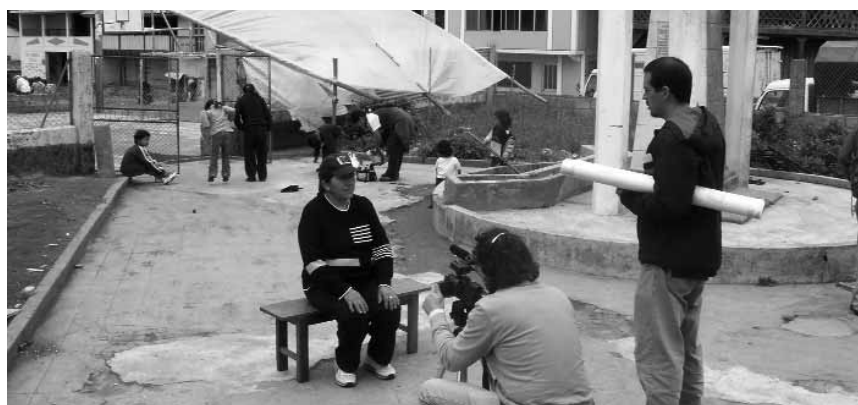
An interview in the community of Bilbao

"Critical Video Analysis" of Project Entitled "Communities Affected by Tungurahua: Mitigating the Risks of Living Near an Active Volcano" Catholic Relief Services (CRS)