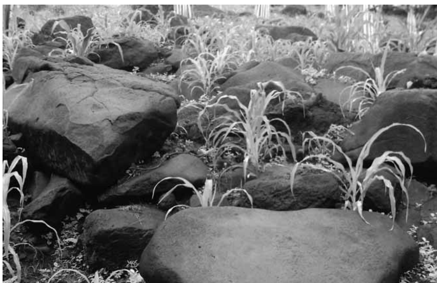
Maize planted between rocks in the community of Pulau Pura