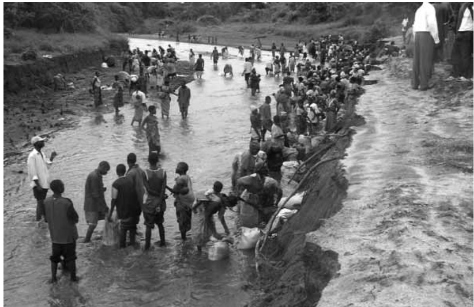
Villagers from Pende village reinforce dyke with sand bags

"Together, We Can Make a Difference": Benefits of Multi-Stakeholder Flood Management Tearfund (In partnership with Eagles)