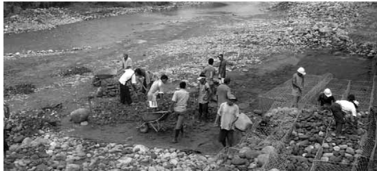
Construction of gabions to prevent inundations in San Martin Alao

(In partnership with ITDG - Soluciones Practicas)