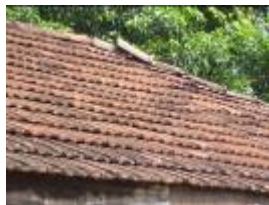
Damaged roof due to wind