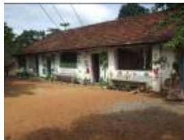
Grade 1- 2 class rooms