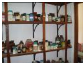
Chemistry lab room