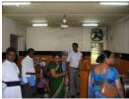
Hazards hunt exercise