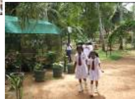
Class rooms (Grade 3- 5)