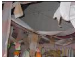
Class room roof