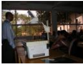
Meeting with Meepe staff