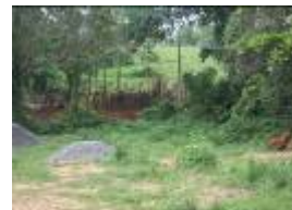
Canal next to school (primary class rooms)