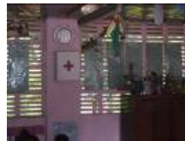
First aid box in class room