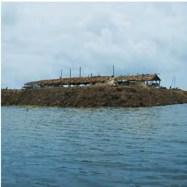
Community safe-haven platform, Takeo province, Cambodia