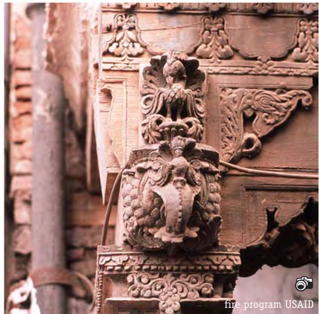
Historic urban areas would benefit from retrofit programs, Ahmedabad, India