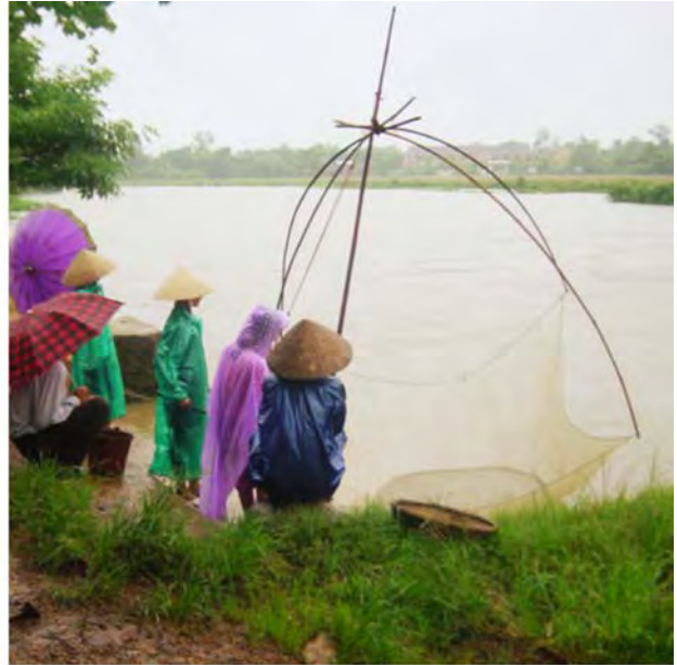
Climate risk affects livelihood on the Mekong, Vietnam