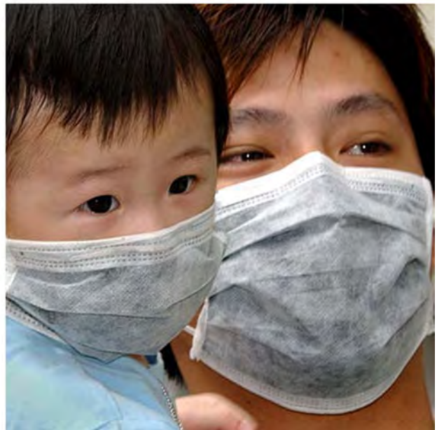
Medical risk mitigation: SARS, China