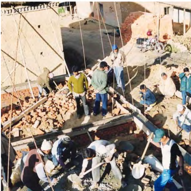
Community construction of earthquake resistant school, Nepal