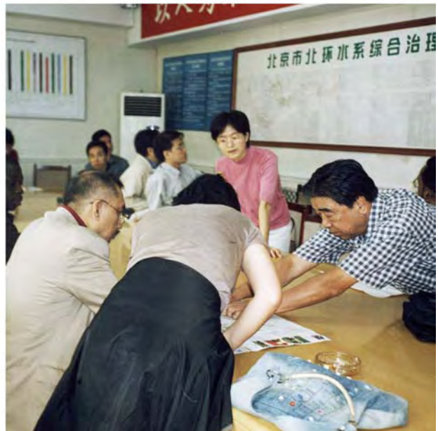
ADPC Regional Flood Risk Management Course, Beijing, China