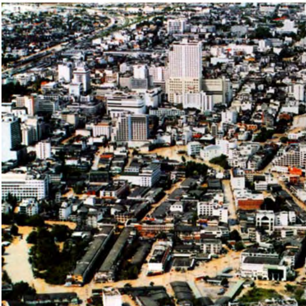
Flood risk condition involved ADPC in flood risk plan, Hatyai, Thailand