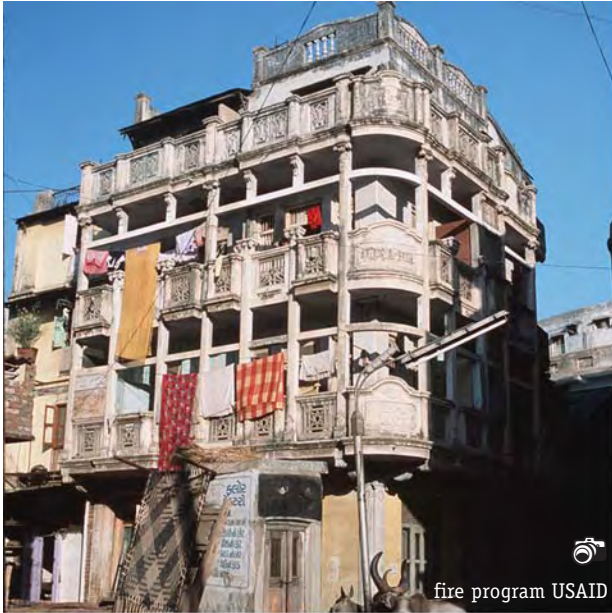
Structure vulnerable to earthquakes, Ahmedabad, India