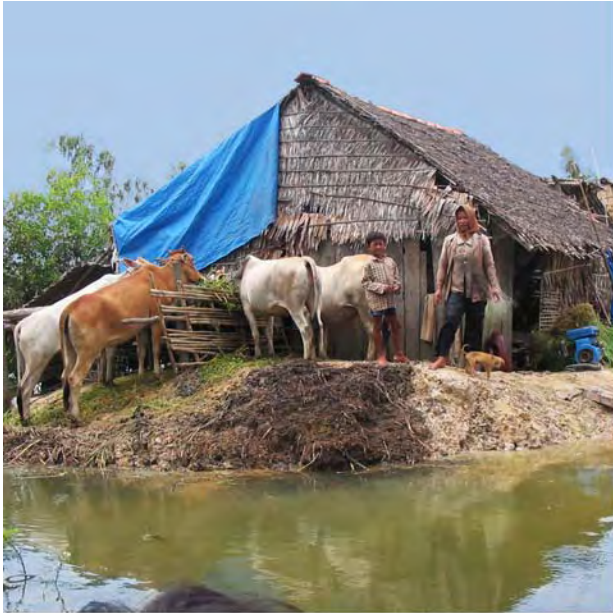
Family built raised platform Takeo Province, Cambodia