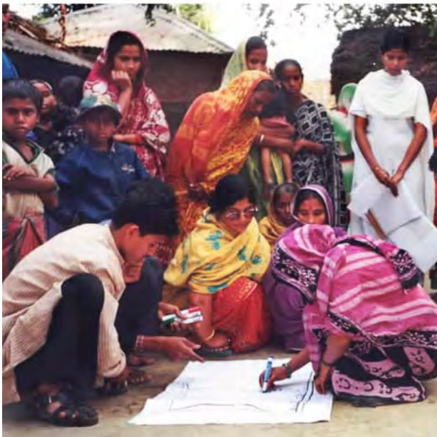
Community flood risk management planning session.