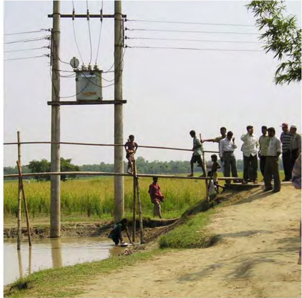
Community emergency bridge, Bangladesh.