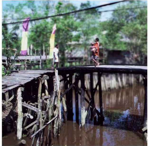
Coping with tidal fluctuations, Agats, Papua, Indonesia