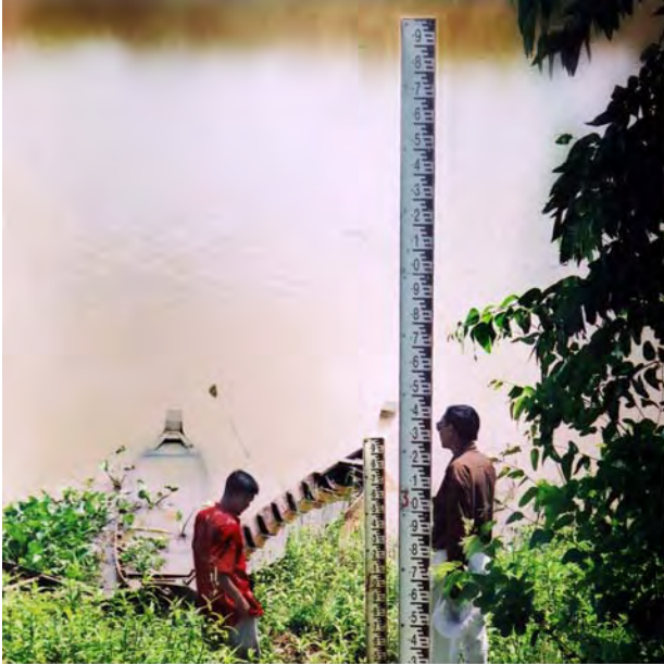
Community flood watch program, Preyveng, Cambodia