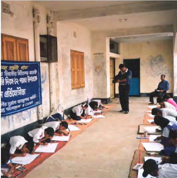
Student participation in flood risk awareness activities, Bangladesh