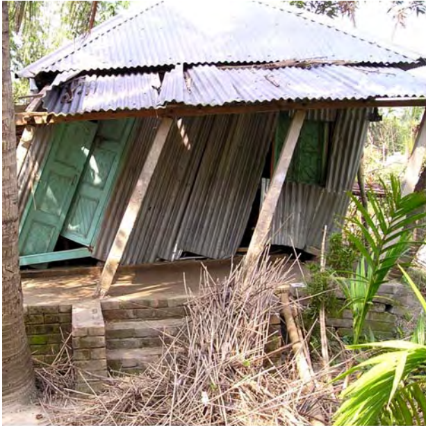
Tornado damaged, improved construction methods can address, Bangladesh