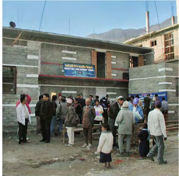
Successful tool retrofit program, Nepal