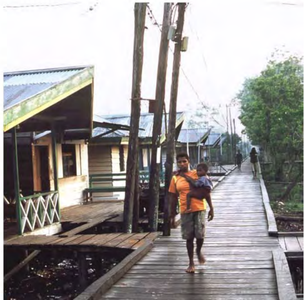
Local government built community infrastructure, raised walkways, Agats, Papua, Indonesia