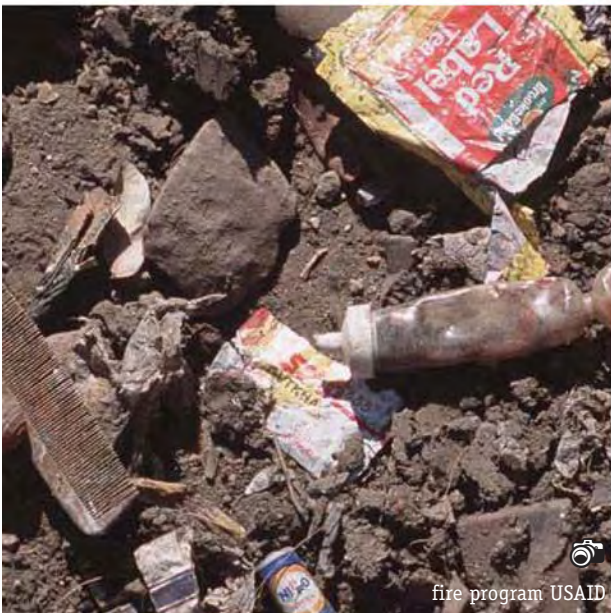
Hazardous waste risk, India