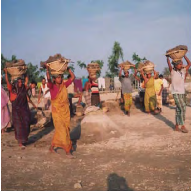
Community participation for landfill flood protection, Bangladesh