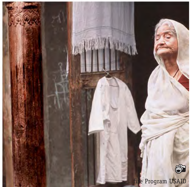
Vulnerable populations and vulnerable historic environments, Ahmedabad, India