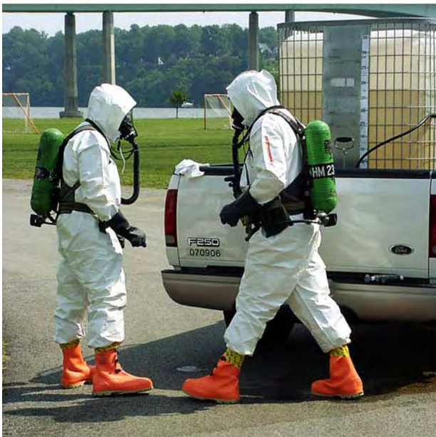
Hazardous material risk training, ADPC