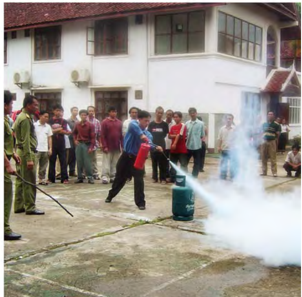
Fire control training, Lao PDR