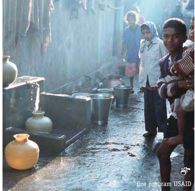
Basic infrastructure protection a priority, India