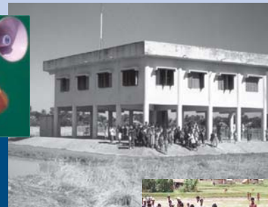
Cyclone Preparedness Programme (CPP)