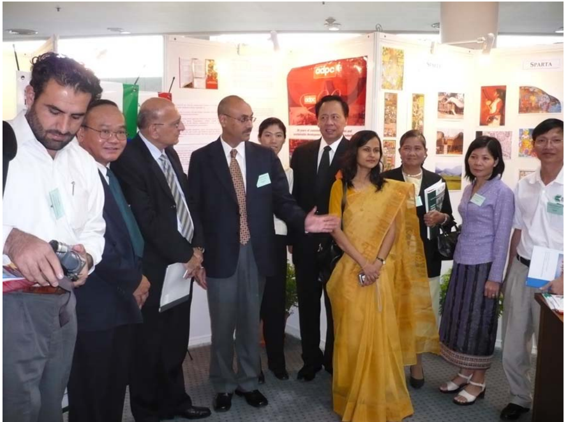
At the ADPC display booth...