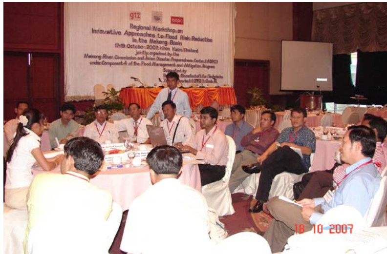
Participants at the Regional Workshop on Innovative Approaches to Flood Risk Reduction in the Mekong Basin

FDRM-8 participants along with the course management team also attended the Regional Workshop on Innovative Approaches to Flood Risk Reduction in the Mekong Basin co-organized by ADPC and Mekong River Commission at Khon Kaen. This provided an opportunity to learn more about the flood risk management practices and approaches in Mekong regions and to build a broader range of networking with other 70 flood disaster management practitioners from the region at the regional workshop.