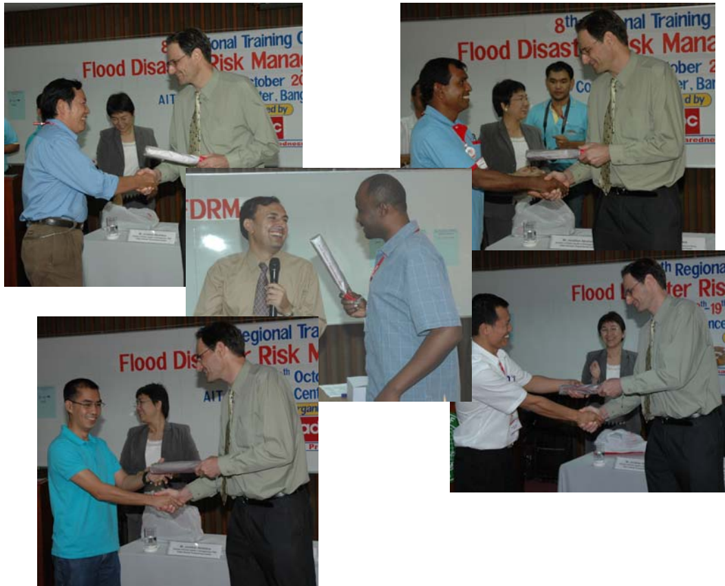
Participants receiving souvenirs, prizes