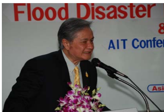
Dr. Suvit Yodmani