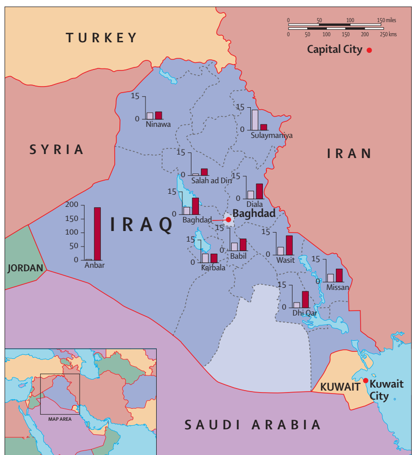
Figure 1: Crude mortality per 1000 people per year, by Governorate, before and after the invasion Bar graphs represent number of deaths per 1000 person-years. Governorate rates are on a scale of 15 deaths per 1000 person-years, except for Anbar governorate, where deaths were more than ten times higher.

We tabulated data and calculated the number of births, deaths, and person-months associated with every cluster. For every period of analysis, crude mortality, expressed as deaths per 1000 people per year, was defined as: (number of deaths recorded/number of person-months lived in the interviewed households) \times 12 \times 1000 . We estimated the infant mortality rate as the ratio of infant deaths to livebirths in each study period