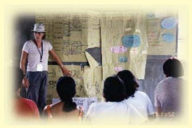
Interactive Facilition by participant with the community during Participatory Risk Assessment