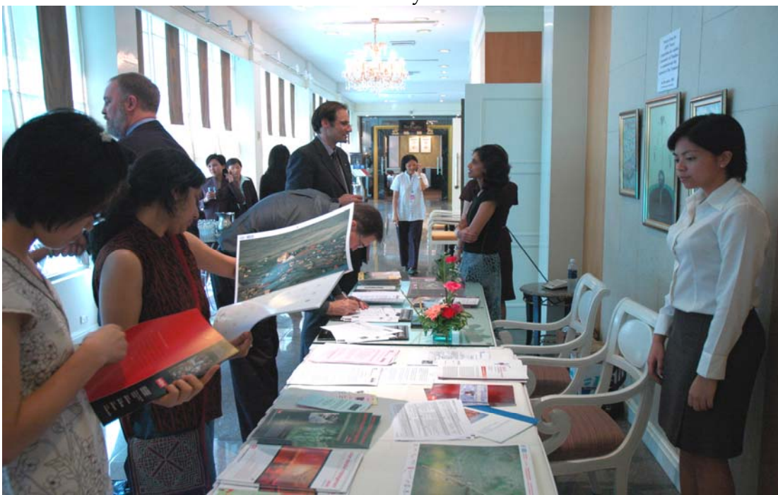
At the Reception Desk...