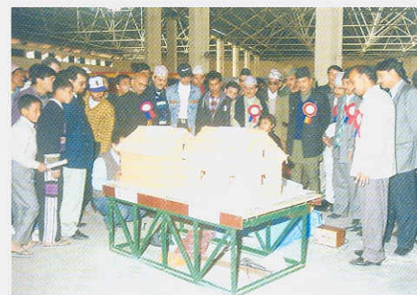
Shake Table Demonstration

Launched in 1995, the AUDMP is an eight-year program designed to respond to the need for safer cities. The Program is funded by United States Office of Foreign Disaster Assistance (US-OFDA). The goal of AUDMP is to reduce the disaster vulnerability of urban populations, infrastructure, critical facilities and shelter in targeted cities in Asia, and to promote replication and adaptation of successful mitigation measures throughout the region. Towards this end, the Program conducts national demonstration projects, information dissemination and networking activities and policy seminars and professional training in the target countries of Bangladesh, Cambodia, India, Indonesia, Lao PDR, Nepal, Philippines, Sri Lanka, Thailand and Vietnam.