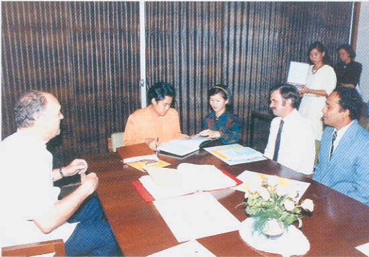
Princess Sirindhorn's visit to ADPC

Based in Bangkok, ADPC is a regional resource center working towards safer communities and sustainable development through disaster reduction in Asia and the Pacific.