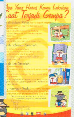
Public Awareness Materials