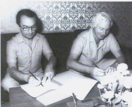
Signing of MOU between ADPC & UNDR0, 1986

Since its establishment in 1986, ADPC programs demonstrate a wide diversity in application, address all types of disasters, and cover all aspects of the disaster management spectrum - from prevention and mitigation, through preparedness and response, to reconstruction and rehabilitation. The Center has been continually adapting its approach to cater more effectively to the specific needs of Asian countries. Today ADPC is a focal point for raising disaster awareness and a leading promoter of total risk management in Asia and the Pacific.