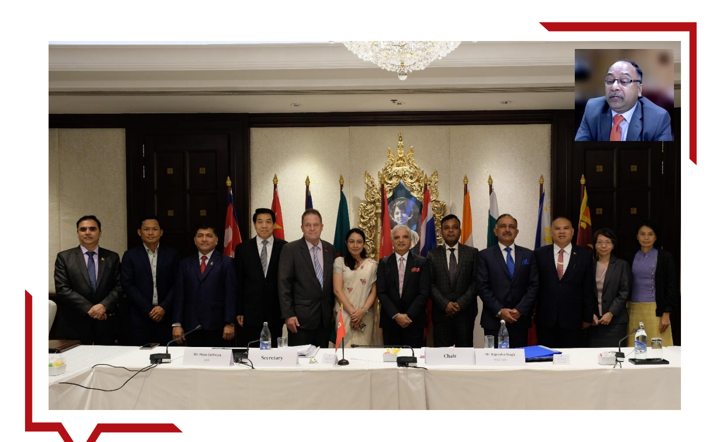
BOT members and representatives