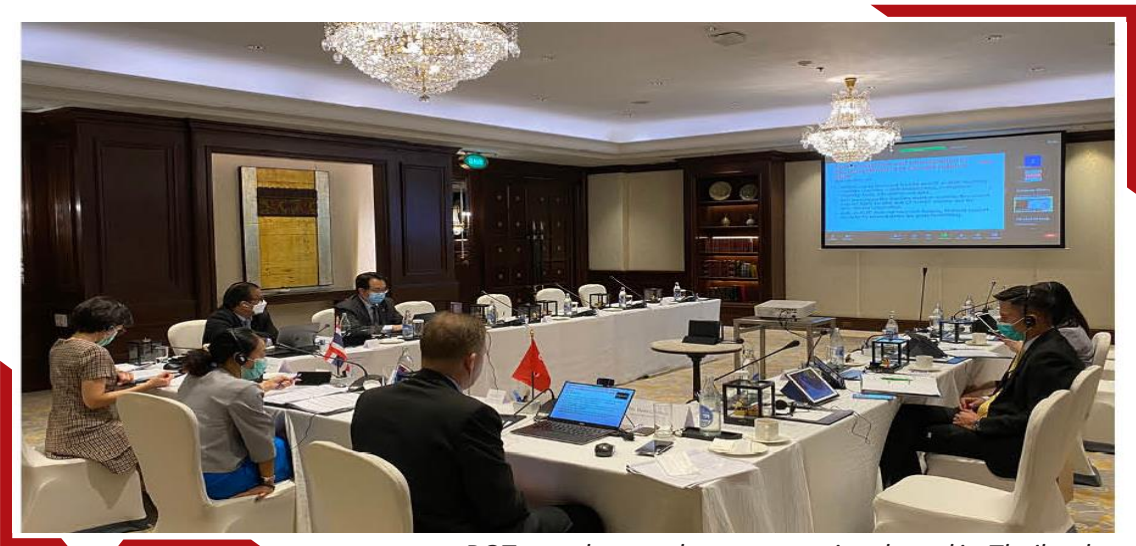
BOT members and representatives based in Thailand